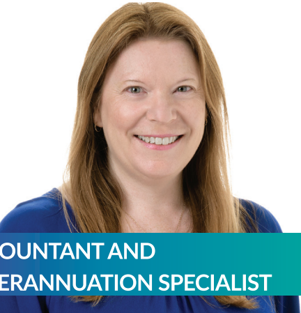
ACCOUNTANT AND SUPERANNUATION SPECIALIST